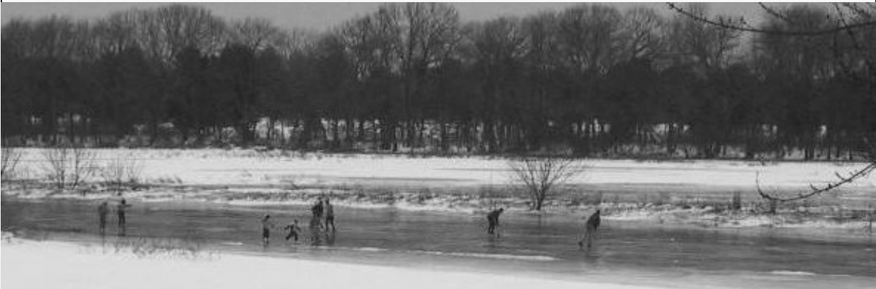
Ice skating on the Sudbury River

Town Meeting was held in Sudbury Town Hall, but it is now held at LSRHS. I remember all residents of the entire town, not divided into precincts, voting at Town Hall.