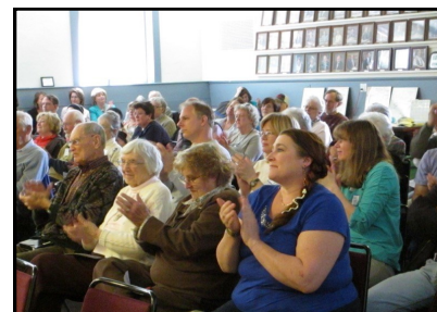
Below, Audience gives approval