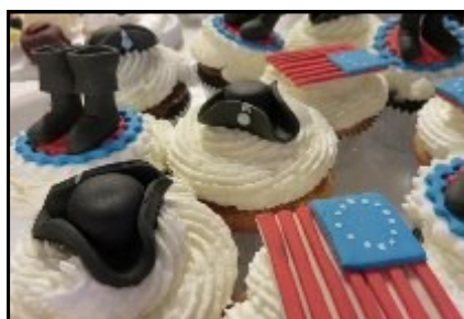
Sudbury’s Ana Salort of Edible Creations by Ana created these cupcakes with miniature tricorn hats, boots and fondant flags.