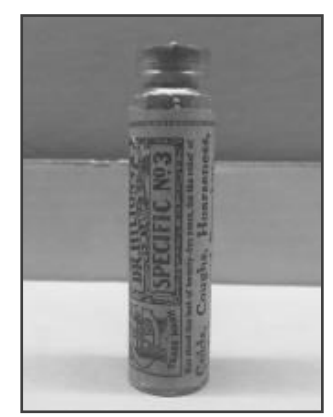
Dr. Hilton's Specific No. 3, SHS Collection.

Dr. Hilton's Specific No. 3 was praised all across the Boston area for its almost magical ability to whisk any hints of a cold away. Panic of pneumonia was sweeping Boston in the early 1890s. The number of deaths supposedly caused by the disease only seemed to be increasing according to a rather detailed report published in the