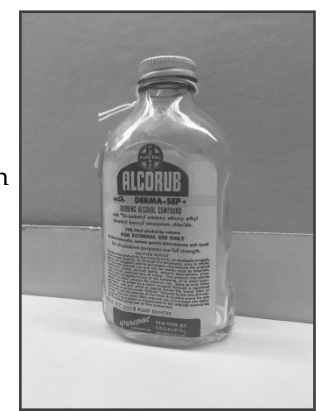
Purepac Alcorub.

In 1951, Purepac held a contest to come up with a slogan for their "health aids" like this Alcorub. Whoever came up with the catchiest one would receive an "expense-free vacation of a lifetime" to Panama. The ad linked "health" and "pleasure". Words like "glamorous" and "luxurious" were sprinkled all over the page. The bells and whistles surrounding Purepac's