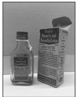
United Drug Company, SHS Collection.

What's unusual about United Drug Co. is its satisfaction guaranteed and return policy. Customers could return products full price if they didn't have the desired effect, which points both to a confidence in their treatments and an honest desire to treat people's ailments. Perhaps they simply realized that working medicine sells.